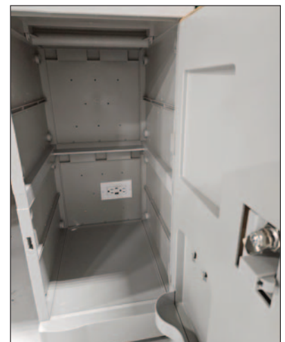
Interior of Large Locker