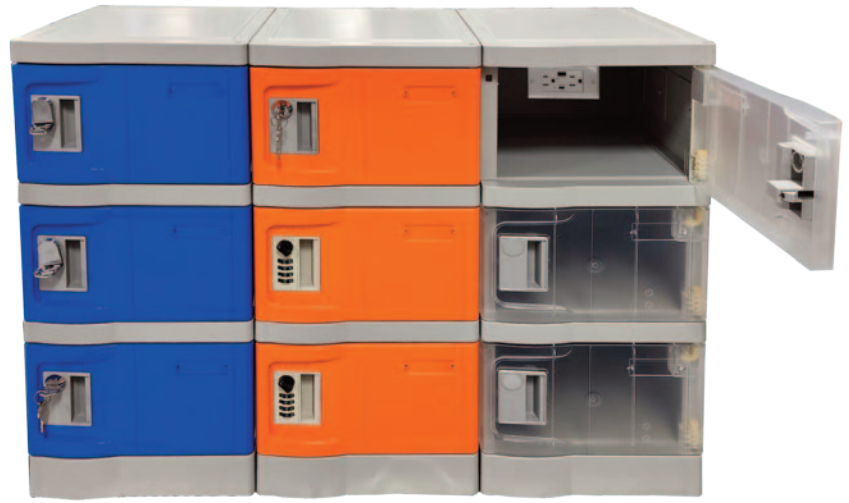
Small Lockers in 3x3 Set

Charging lockers help improve security for electronic assets